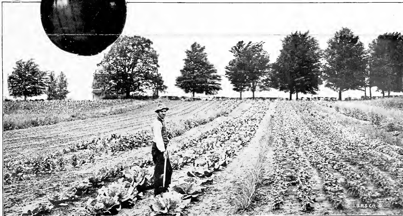
J. B. R. S. Co.